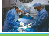
Medical Malpractice / Wrongful Death

But our website www.YourMeadvilleInjuryLawyers.com can tell you plenty! Like: