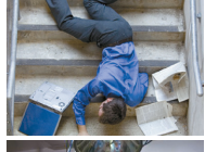
Slip & Fall Accidents