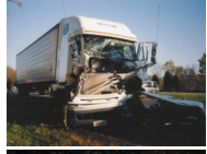
Commercial Truck Accidents